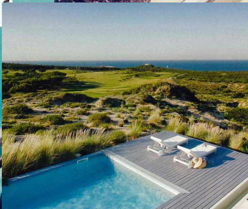
Above: the Oitavos hotel and spa is located on the coast just outside Lisbon. Below: the lobby of the ultra-contemporary Devi Ratn resort in Rajasthan.

own Dorchester) will this month open its first country-house hotel. Coworth Park ( www.coworthpark.com ; from £276) intends to impress on several levels: the rich upholstered interiors (anyone who's visited The Dorchester's dazzling sugar-spun spa designed by the same firm will feel right at home); the eco credentials (a biomass boiler fuelled by wood from willows grown on the estate in sustainable cycles will produce the hotel's carbon-neutral energy); and proximity to the M3-M25 junction, meaning that Heathrow and Gatwick are as close at hand as Mayfair and Knightsbridge.