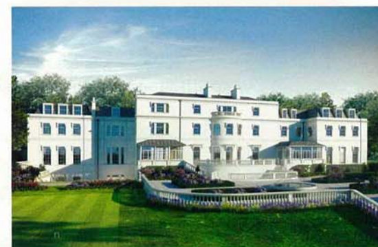
Above: Coworth Park country-house hotel, near Ascot in Berkshire.