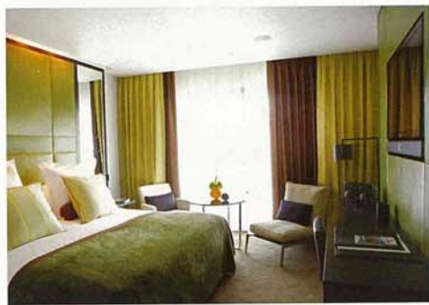
Above: Hotel Verta on London's South Bank.

→ Business and leisure travellers in and out of LONDON this autumn will be pleased to learn of two new hotels with easy access to the city's main air-transport facilities, but still close enough to town to enjoy its attractions. Adjacent to the London Heliport at Battersea, Hotel Verta